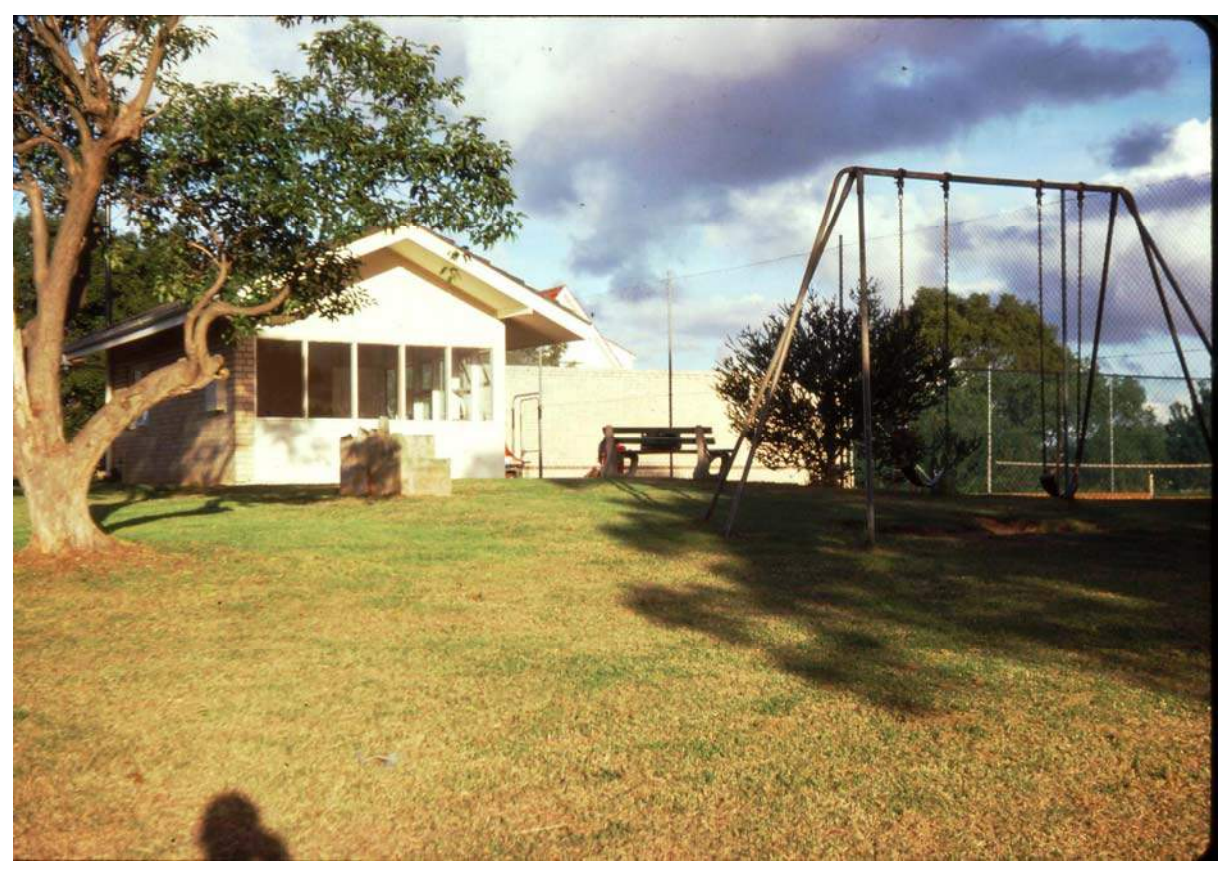
CLUB HOUSE - MAY1976

A specification for the GTC club house was prepared in May 1966 and a quotation for $3771 was accepted by Lane Cove Council although the final cost was $4009 due to problems connecting the electricity supply. By June 1967 the club house was complete except for some carpentry work, painting and electrics.