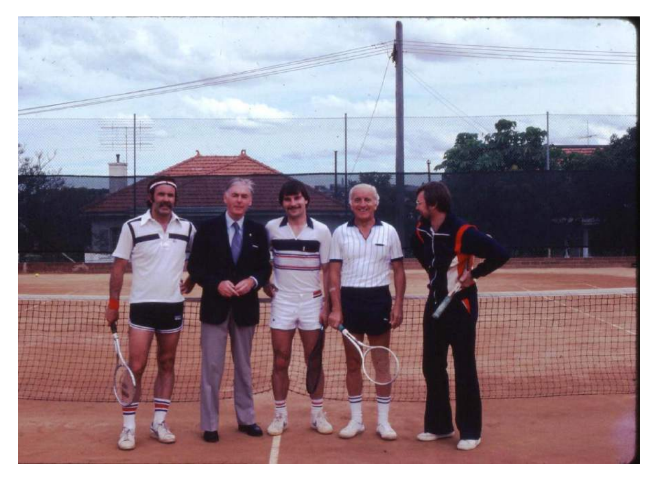
GREENWICH MENS TEAM NOVEMBER 1981

To maintain a high playing standard for the NSTA competition during the 1970s and 1980s the playing standard was set fairly high for prospective new members and it was not unusual for some applicants to be rejected, sometimes more than once, with the result that one or two committee members developed somewhat of a reputation in Greenwich.